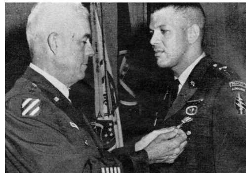
Then-Capt. Paris D. Davis receives the Silver Star on Dec. 15, 1965.

Davis first deployed to Vietnam in 1962 and again in 1965, where he was promoted to captain as a detachment commander with the 5th Special Forces Group (Airborne), 1st Special Forces making him one of the first African American Special Forces officers as the civil rights movement gained momentum at home.