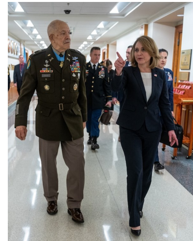
Deputy Secretary of Defense Kathleen Hicks walks with retired Army Col. Paris Davis prior to his Medal of Honor Hall of Heroes Induction Ceremony at the Pentagon, March 6, 2023. Davis received the Medal of Honor for his acts of bravery as a commander during the Vietnam War.

Davis' Medal of Honor paperwork had been lost twice, resulting in this honor being postponed 56 years after his initial nomination. (ABC News)