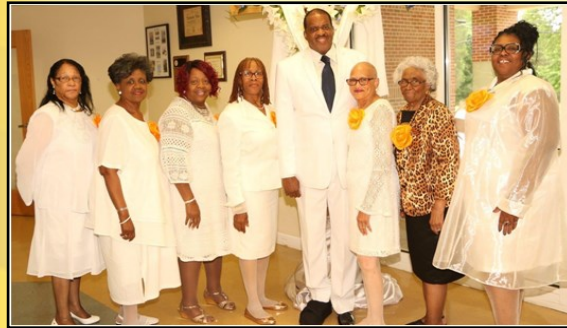
The Vintage Gospel Singers of Washington, DC

It all started back in 1995 with an invitation to sing "Old Time Gospel Music" at a Black History Month Program. After twenty-eight years, The Vintage Gospel Singers of Washington, DC, is still on a mission to preserve the legacy of "Pioneer Gospel Music", and the many legendary artists that paved the way for young artists and musicians today. The Singers also have an Outreach Ministry that ministers at nursing homes and other convalescent facilities.