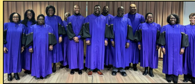
Fort Belvoir Gospel Service Adult Choir Fort Belvoir, VA

It all started back in 1995 with an invitation to sing "Old Time Gospel Music" at a Black History Month Program. After twenty-eight years, The Vintage Gospel Singers of Washington, DC, is still on a mission to preserve the legacy of "Pioneer Gospel Music", and the many legendary artists that paved the way for young artists and musicians today. The Singers also have an Outreach Ministry that ministers at nursing homes and other convalescent facilities.