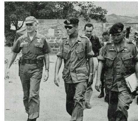
Capt. Paris Davis, center, gave a tour of his camp in South Vietnam to the commander of U.S. forces there, Gen. William Westmoreland, left.