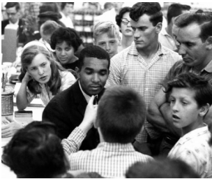
Mulholland (left) participating in a 1960 sit-in demonstration at a Virginia drugstore.

Joan Trumpauer Mulholland, a recipient of the 2015 National Civil Rights Museum Freedom Award, is a Civil Rights Icon who participated in over 50 sit-ins and demonstrations by the time she was 23 years old. She was a Freedom Rider, a participant in the Jackson Woolworth's Sit-in, the March on Washington, the Meredith March and the Selma to Montgomery March. For her actions she was disowned by her family, attacked, shot at, cursed at, put on death row and hunted down by the Klan for execution. Her path has crossed with some of the biggest names in the Civil Rights Movement: Martin Luther King, Medgar Evers, Fannie Lou Hamer, John Lewis, Diane Nash and Julian Bond. She has appeared in numerous books and documentaries and has received numerous awards and recognition for her work in the Civil Rights Movement including the 2019 International Civil Rights Museum Trailblazer Award, the 2018 "I Am a Man" Award, Delta Sigma Theta Sorority, Incorporated Annual Award of Honor and the Anti-Defamation League Annual Heroes Against Hate Award.