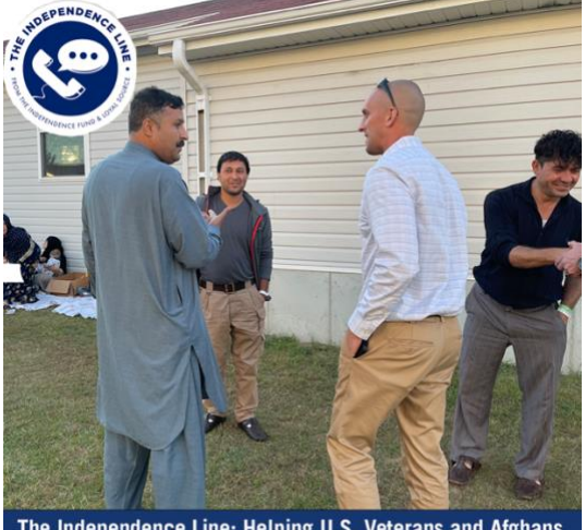
The Independence Line: Helping U.S. Veterans and Afghans with issues stemming from the Afghanistan withdrawal