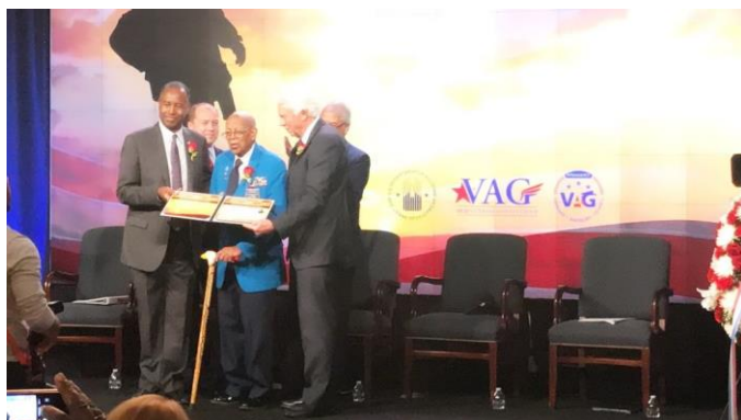
HUD Veterans Affinity Group honoring Tuskegee Airmen

This event was held on Thursday, May 23, 2019 from 11:30 a.m. to 12:30 p.m. in the Brooke-Mondale Auditorium. This year's theme: "A Soldier, Marine, Sailor, Airman, or Guardsman Only Dies If You Never Mention Their Name." On this Memorial Day, the HUD Veterans Affinity Group (VAG) took time to "Honor, Observe, Remember Our Heroes" and the bravery of the Tuskegee Airmen, and the more than 80 Tuskegee Airmen who made the ultimate sacrifice for this nation.