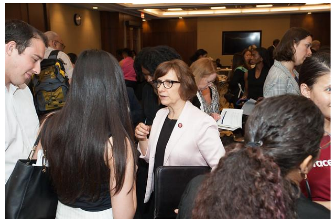
Rep. Suzanne Bonamici (D-OR), founder and Co-Chair of the STEAM Caucus

sector STEAM programs that encourage girls and women to pursue STEAM education and careers. The Women's Congressional Policy Institute nonprofit partners included: Girl Scouts of the USA; National Academies of Sciences, Engineering, and Medicine; MD Center for Women in Computing, U of MD College Park; Patriots Technology Center; and Society of Women Engineers. Federal partners included: National Aeronautics and Space Administration; National Institutes of Health Office of Research on Women's Health, National Science Foundation; Department of Veterans Affairs Center for Minority Veterans; Center for Women Veterans, and the Veteran Employment Services Office. For more information contact the Women's Congressional Policy Institute, 409 12th Street, SW, Suite 702, Washington, DC 20024 or call (202) 554-2323; website: www.wcpinst.org .