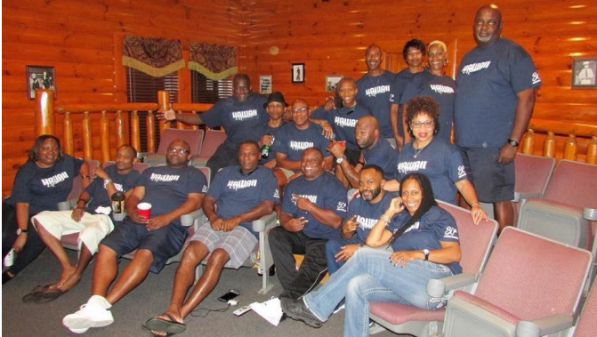
The Hawaii Marines are a group of professionals who are retired and former active duty Marines who were stationed together in Oahu, Hawaii from 1987 to 1992.

The National Association of American Veterans, Inc. (NAAV) is partnering with The Hawaii Marines for a volunteer event at the Armed Forces Retirement Home on Saturday, October 12, 2019.