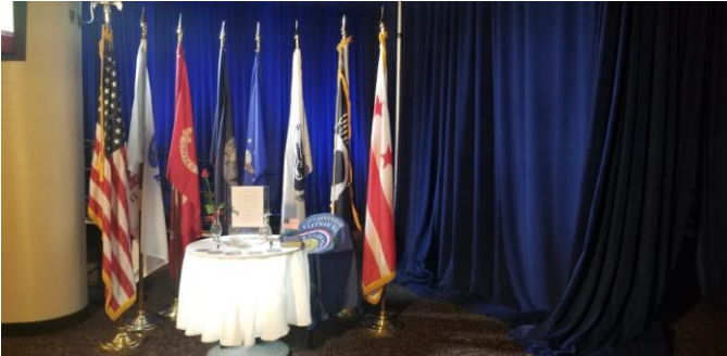
Missing Man Table

At the event, a traditional setting was reverently provided for the Missing Man.