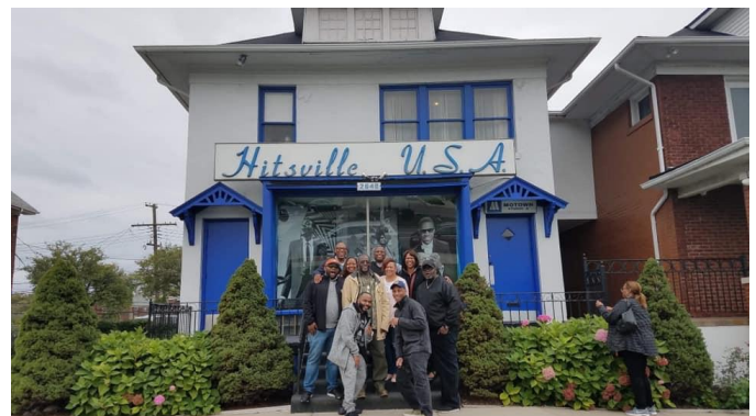
The Hawaii Marines coming together to reminisce and give back to the community.

It's a natural fit for NAAV and the Hawaii Marines to partner in this volunteer event. The mission of both organizations is to help those who, for many reasons, are not able to help themselves.