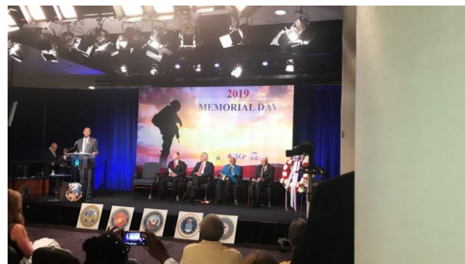
2019 Memorial Day presentation and keynote address

Among the many guests included the Gold Star Mothers, and the Gold Star Wives of our fallen soldiers who loved ones also have made the ultimate sacrifice for our country.