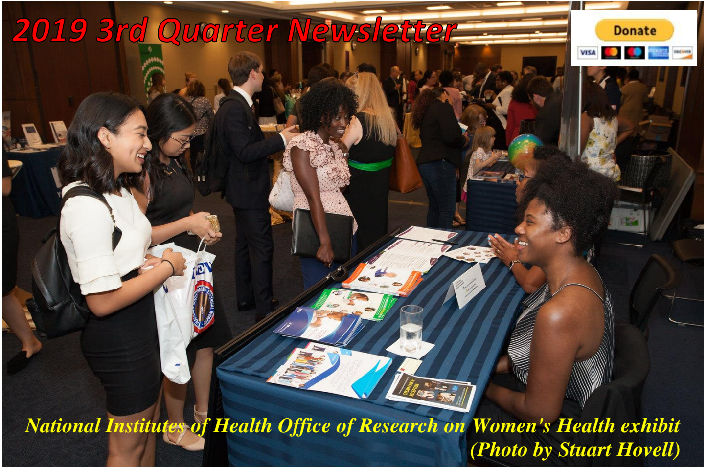
National Institutes of Health Office of Research on Women's Health exhibit