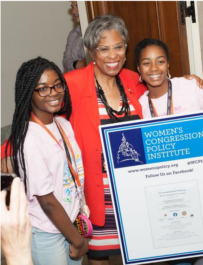
Rep. Brenda Lawrence (D-MI), Co-Chair, Congressional Caucus for Women's Issues, with girls from Patriots Technology Training Center

The National Association of American Veterans, Inc. (NAAV) attended the Seventh Annual Steam Fair and Reception sponsored by the Women's Congressional Policy Institute held on Tuesday, July 16, 2019 in cooperation with Congresswoman Brenda Lawrence and Congresswoman Debbie Lesko, Co-Chairs, Congressional Caucus for Women's Issues and Congresswoman Madeleine Dean & Congresswoman Jennifer Gonzalez-Colon, Vice Chairs, Congressional Caucus for Women's Issues. A brief program was presented by the Women's Caucus leadership from 6-6:30 p.m. at the 2043-2045 Rayburn House Office Building, Washington, D.C. Over 150 attendees with over fifteen exhibits, featuring both public and private